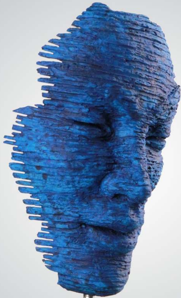
FAITH MASK MINIATURE